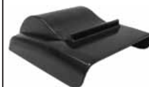
Spill Protect Cover